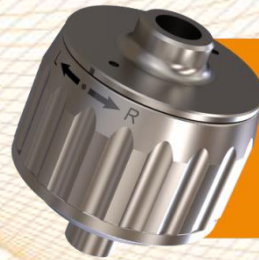
T30 - RATCHET