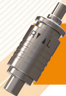
RS - RATCHET